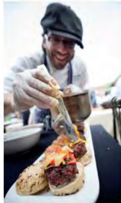
Eight different kinds of burgers were served during the Burger Bash, including this Moroccan lamb/eggplant burger and shiitake mushroom/beet burger.

THE FOODSERVICE INDUSTRY IS A HOTBED OF INNOVATION , with an array of new tools emerging from tech startups and a growing number of interdisciplinary initiatives on college and university campuses devoted to improving the food system. That's the message in the 2015 Menus of Change Annual Report, released during the 3rd Annual Menus of Change® Leadership Summit, June 17-19, at The Culinary Institute of America, Hyde Park, New York, held in partnership with Harvard T. H. Chan School of Public Health. The report rates the foodservice industry's progress toward addressing public health and environmental imperatives. The past year saw positive trends in diet and health, with a decrease in the intake of trans fat and sugar-sweetened beverages and a modest increase in the intake of whole fruits and whole grains. However, confusion is high among consumers about what to eat. Highlights of the conference included a plant-forward Burger Bash, with the traditional burger concept rethought in a variety of inventive ways. There were also presentations from chefs, foodservice professionals and public health, environment and business strategy representatives. More information is available at www.menusofchange.org/ .