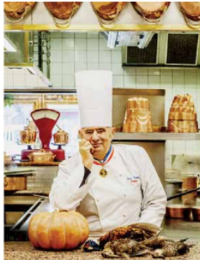
GRAND AMBITION! 'I am ready to plan the future now,' says the 86-year-old Bocuse, seen here in the kitchen of his restaurant in Lyon, France.

As France's original celebrity chef, Paul Bocuse built a Michelin-starred culinary empire and established the most prestigious cooking competition in the world. And yet, one goal still eludes him. Now he's turned to America's top chefs to help make it a reality even if it means breaking from his own haute traditions